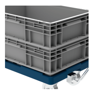
SPACE OPTIMIZATION Allows stacking